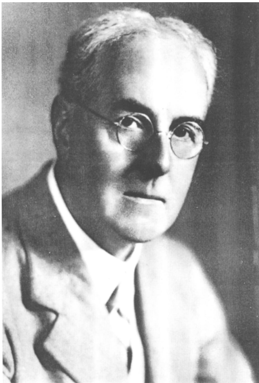
LEWIS FRY RICHARDSON. D. Sc., FRS